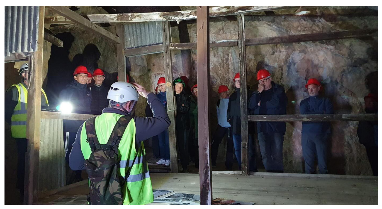
Specialist volunteer led tours raise awareness about Gibraltar's heritage and history.