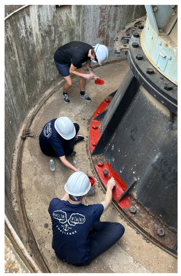
Students from the University Royal Naval Unit, London, helping out at Princess Anne's Battery