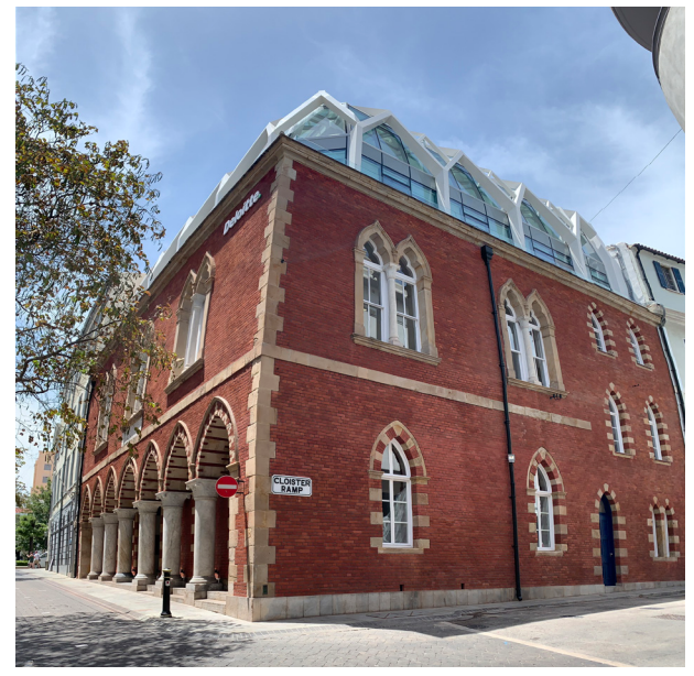
Managing change to our historic buildings