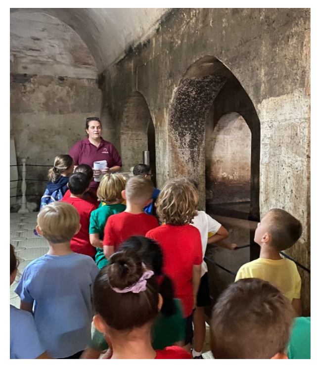
Delivering outreach programme

Gibraltar's physical heritage is an irreplaceable asset that requires careful preservation and sustainable use. Conservation efforts will see the Gibraltar Heritage Trust always working closely with stakeholders, including government bodies, private developers, and NGOs, to champion conservation-led initiatives.