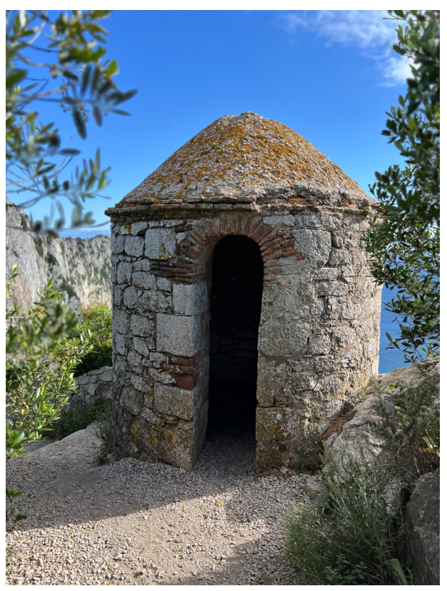
Monitoring and advocacy

life. Vital to its success is effective stakeholder engagement which will also aid the Gibraltar Heritage Trust's strategic objectives to place Gibraltar's heritage at the centre of human development and sustainable change whilst fostering a deeper understanding of the past to shape a brighter future.