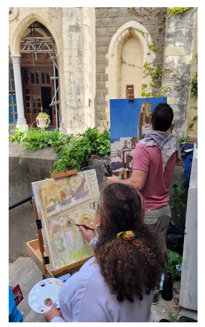
Entries underway at our annual open air painting competition

In its Strategic Plan 2025 to 2028 the Gibraltar Heritage Trust sets out further steps to continue to be well-equipped to place Gibraltar's heritage at the heart of community