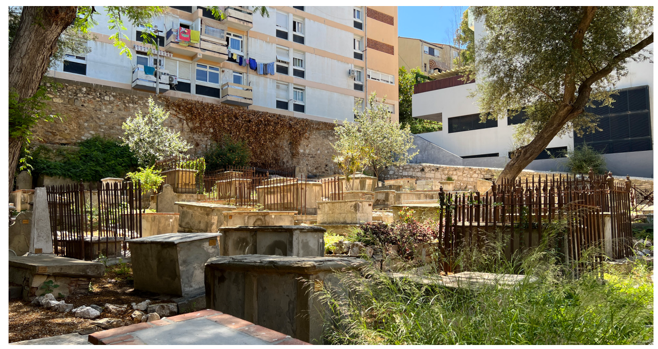
Restoration of historic sites