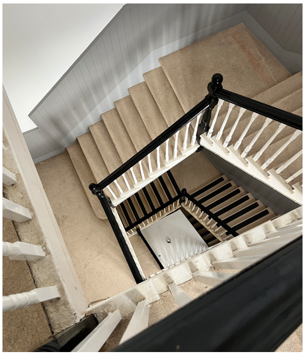
Recording our buildings

This is fundamental in continuing the work of the GHT into the future. The sustainability of its activities into the future will depend on diversified funding sources and efficient resource management. This includes collaborations with like-minded businesses and organisations that will lend opportunity to the exploration of new funding streams.