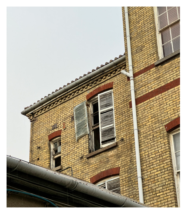
Advocacy for our built environment

Culture and heritage are intrinsically linked, and the GHT will seek to continue to collaborate with local and international organisations to promote heritage. Our membership base will be core to achieving this with the aim of bringing all elements together at the forefront of community life.