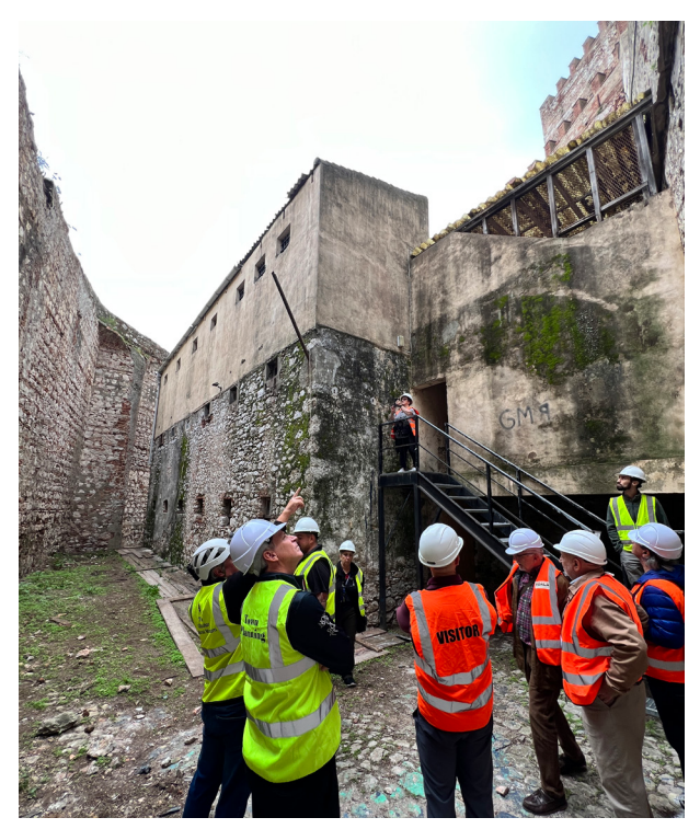
Stakeholder consultation and collaboration