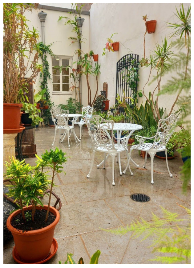
Patio at the Main Guard maintained by volunteers

The Strategic Plan will put into action a variety of initiatives, projects and strategies that will interconnect to raise the profile, level of awareness and perceived value of our heritage. Amongst the aims, the Trust wants to create an informal Community Heritage Forum which will foster dialogue and collaboration involving all key players. That means all of us. Government agencies, local communities, NGOs, educational institutions, the tourism industry-residents, visitors, businesses, and institutions-who will come together to discuss, share, and develop ideas for the conservation and promotion of our heritage. The Gibraltar Heritage Trust believes this will ensure Gibraltar's history is not only remembered but is actively celebrated and shared by all.