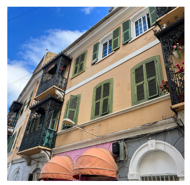
Working for the improvement of our heritage fabric