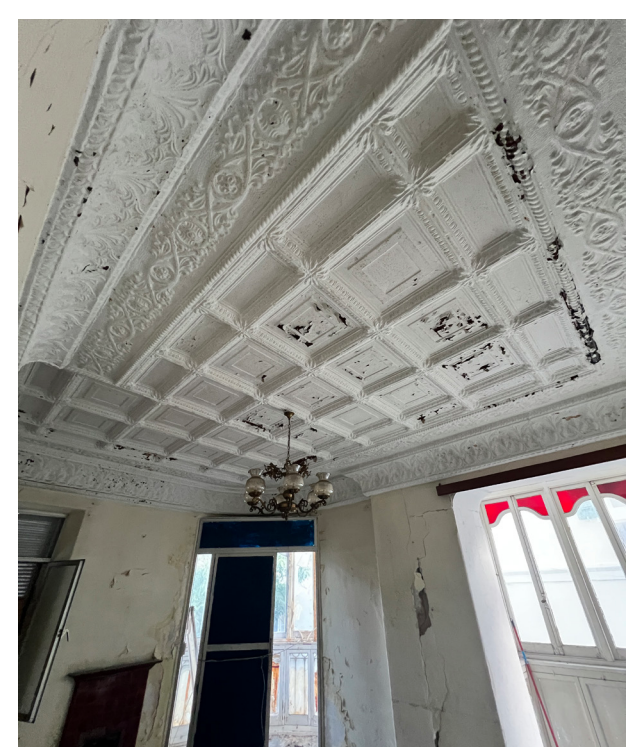
Recording architectural detail

This document will act as a guide for the GHT in its complex undertaking to continue to work in making our heritage the driver of cultural, economic and social improvement.