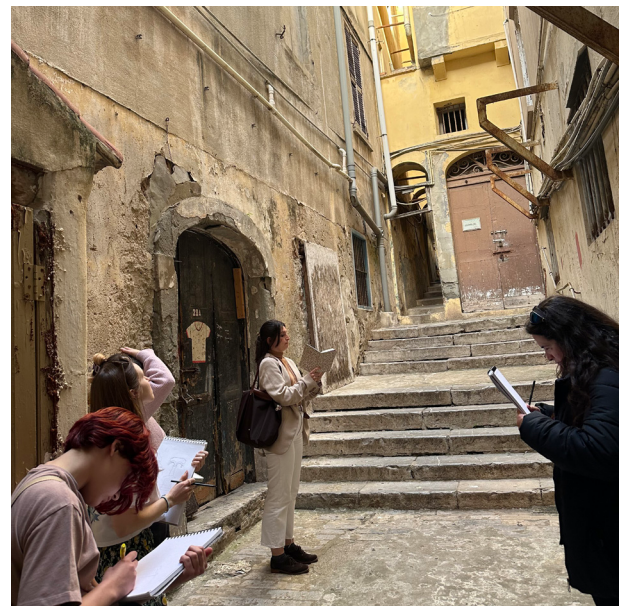
Bringing culture and heritage together

The Gibraltar Heritage Trust envisions a society where Gibraltar's unique heritage is understood, appreciated and celebrated by all. A society where all citizens, irrespective of affiliation or background, work together to value, respect, and sustainably utilize our unique legacy. Collectively driving forward environmental, cultural, economic and social progress.